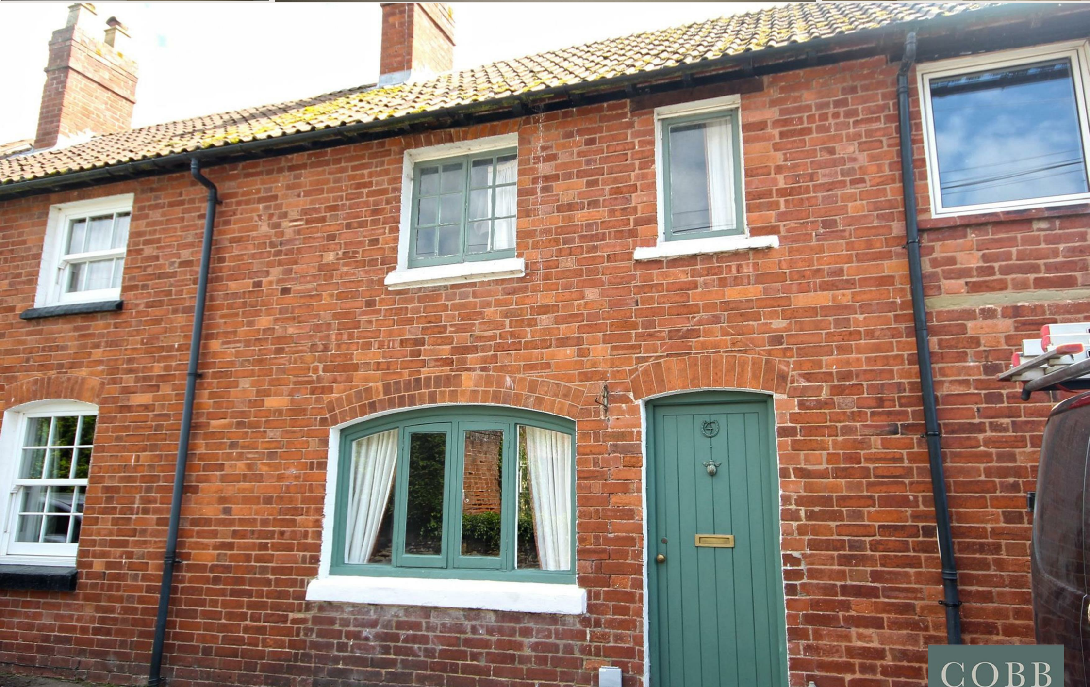
4 Marsh Cottages, The Marsh, Wellington, Hereford., HR4 8DU Price £217,500